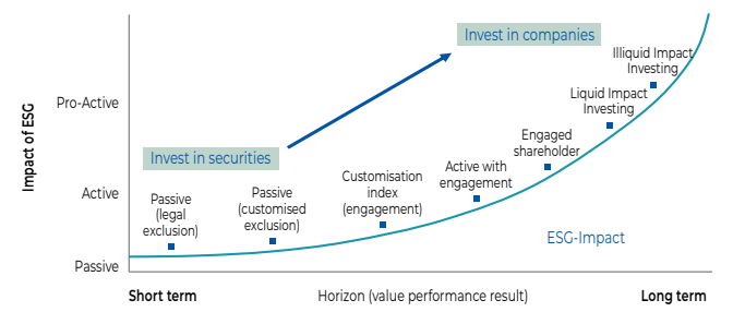
Figure 1: How does the horizon correlate with impact?

One difficulty with social Impact is that it requires a long-term commitment whereas the time horizon for negative screening can be shorter. Figure 1 shows a relative view of the required time horizon compared with the ESG implementation.