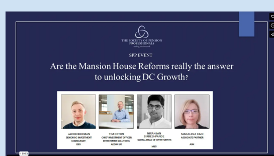
Are the Mansion House Reforms really the answer to unlocking DC growth