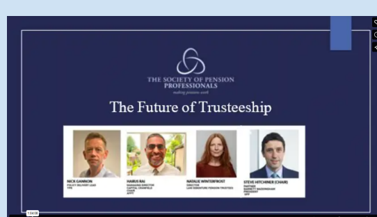
The Future of Trusteeship