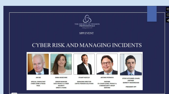
Cyber Risk & Managing Incidents