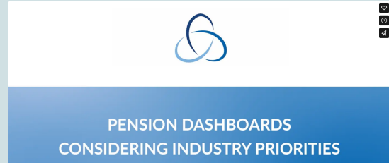
Pension Dashboards – Considering Industry Priorities and PASA Value Guidance