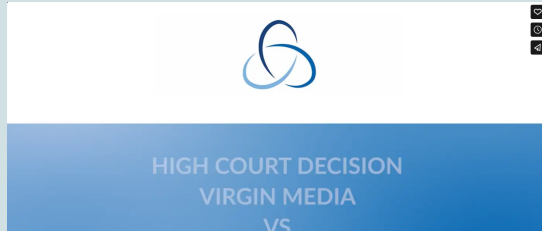
SPP Emerging Issue Event - High Court Decision, Virgin Media vs. NTL Pension Trustees